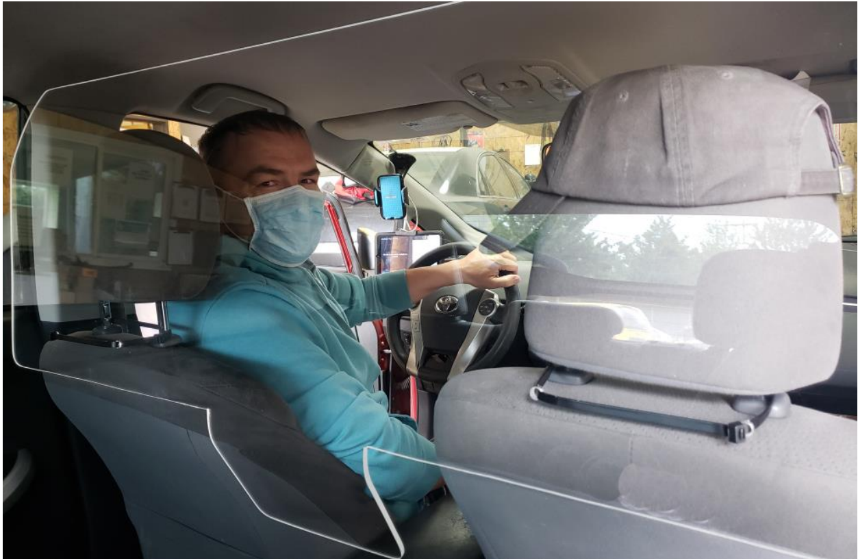
Broadway Cab driver with new safety measures in place; mask & divider.